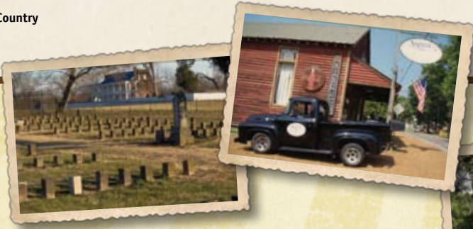
Pictured: McGavock Confederate Cemetery, Franklin; Antique shop, Leiper's Fork; Walnut Grove historic home, Mount Pleasant.